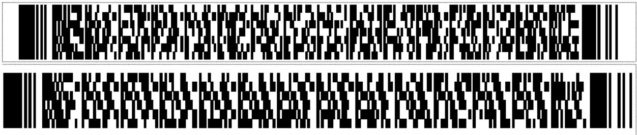
1 Sample of Data Version 3 2D Barcode generated by DOR.